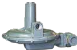
Model 243 Regulators