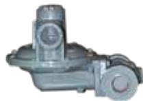
Model 496 Regulators