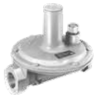
Model 325-5A Regulators

We offer the products that will regulate its pressure or meter its flow! Whether it's for a small burner, a unit heater or a high pressure industrial gas application, we have what you need.