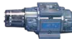
Turbine Flow Meters